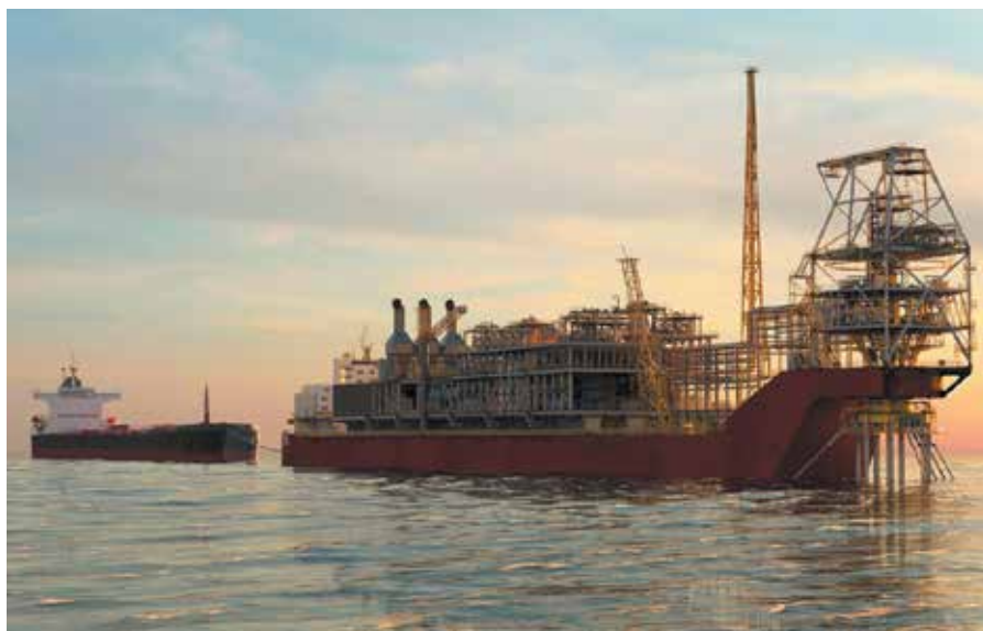
Artist impression of the FPSO for the Sangomar Field Development offloading oil to an offshore tanker.

The development includes the installation of a stand-alone floating production storage and offloading (FPSO) facility and subsea infrastructure that will be designed to allow subsequent development phases.