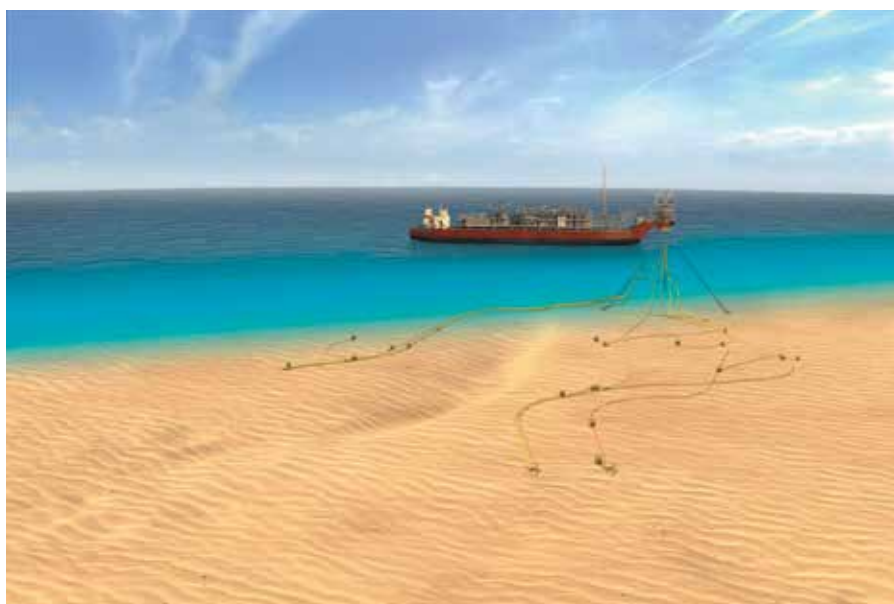
Artist impression of the FPSO connected through risers to the network of flowlines and subsea infrastructure.